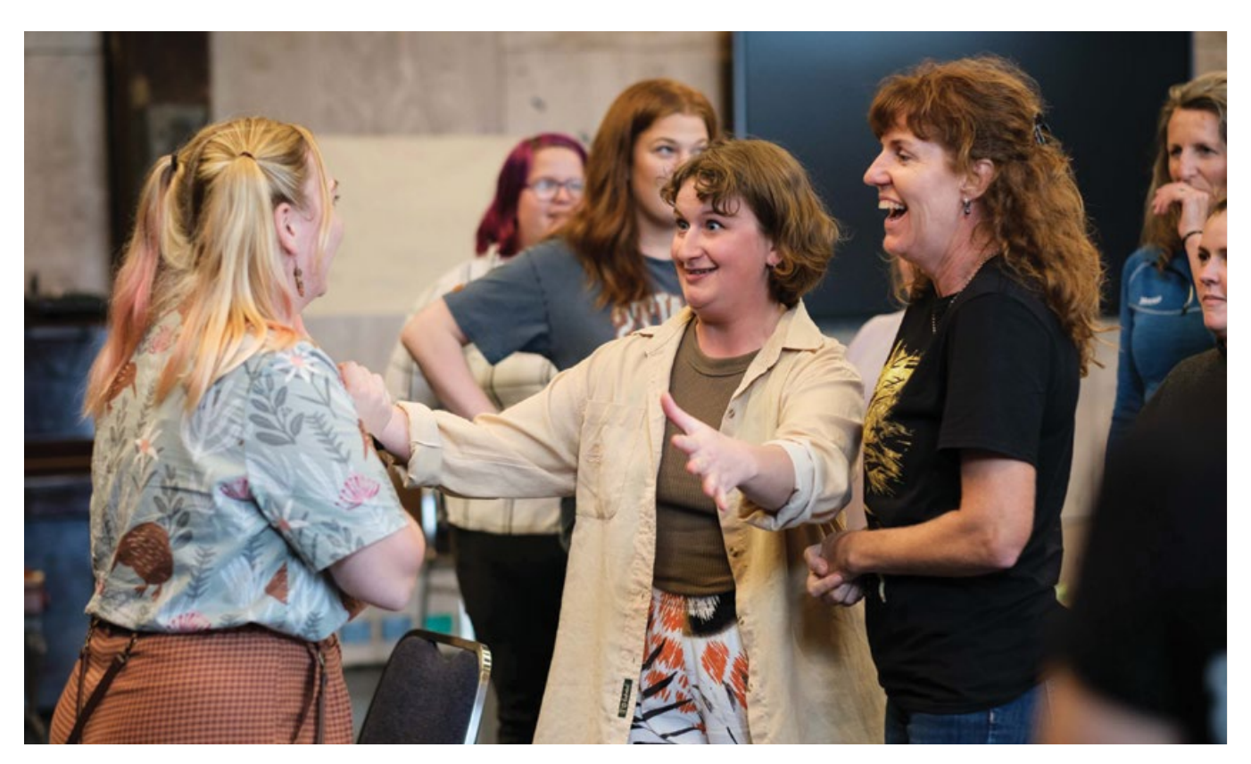
Participants taking part in the Bell Shakespeare mentorship program.

Our long-term partnership with the Credit Union Foundation of Australia (Cufa), an international development agency committed to alleviating poverty and creating sustainable results across the Asia Pacific, continued to address poverty in Cambodia.