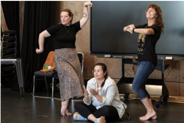
▲ Participants taking part in the Bell Shakespeare mentorship program.

For the past eight years, alongside our partner Bell Shakespeare 31 , each year we have provided 30 teachers from across Australia with a year-long mentorship, the National Teacher Mentorship. During intensive learning days, the teachers learn innovative teaching techniques, Shakespeare strategies, and active learning principles to engage learners from across all year levels. Through this partnership, we aim to build capability and capacity into the sector and support the empowerment of teachers through the delivery of high quality professional development.