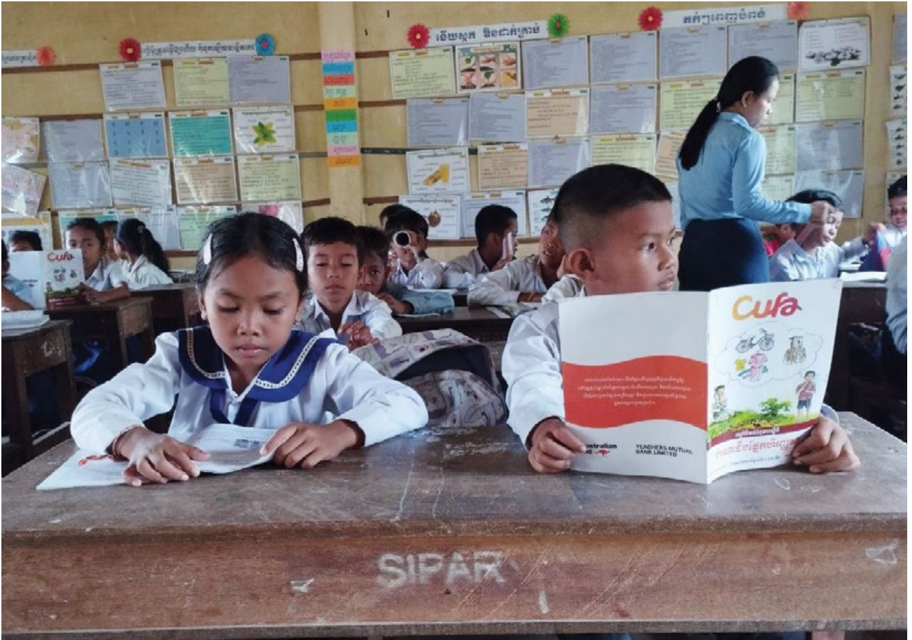
▲ Students taking part in the Children's Financial Literacy (CFL) program in Cambodia.